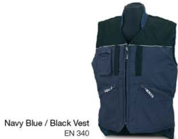
Navy Blue / Black Vest EN 340