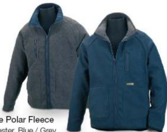
Reversible Polar Fleece 100% Polyester. Blue / Grey