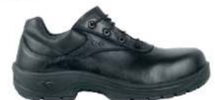
Model: Karolus S3 HRO SRC