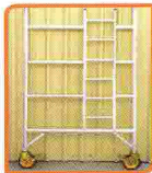
4 Rung Ladder Frame