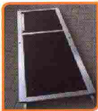
Fixed deck (Wooden)