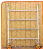
4 Rung Span Frame