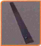
Toe Board (Wooden)