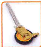
200mm Heavy Duty Caster Wheel with Jack