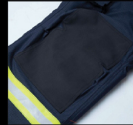
Knee Pad with double stitch for more durability