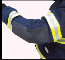
Action Elbow provides extra ease in movement during different activities