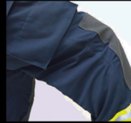
Action Knee adds length over the knee so you can step up, sit down, kneel, or crawl freely