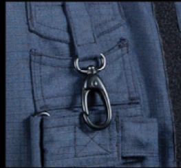
Lamp Holder can be adjusted according to lamp size