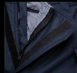
Slant Fly Closure with FR zipper & velcro