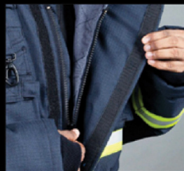
Double Closure with FR zipper & velcro