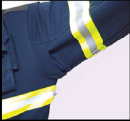
Action Sleeve provides extra length when you reach