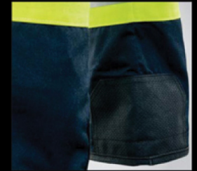
Ankle Guard to protect exposed areas against abrasion