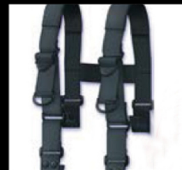
H-Back Suspenders with padding at shoulder area