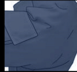
Action Seat adds length in the seat to allow you to bend at waist and knees freely