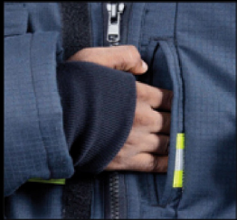
Napolean Pocket under the front placket