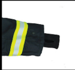
Telescopic Cuffs keep debris and water out. In addition Modacrylic cuffs with thumb hole