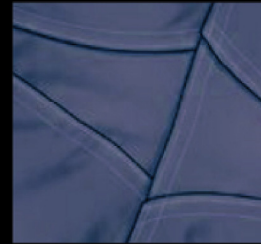
Diamond Crotch Gusset distributes stress in both shell and liner for durability