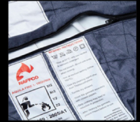
Inspection Opening with zipper to check status of membrane