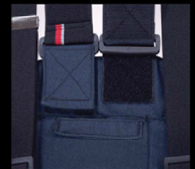
Velcro Fasteners for rapid release and attachment of the braces