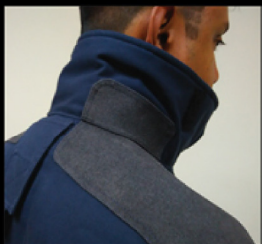
Collar Reinforcement provides extra protection and strength