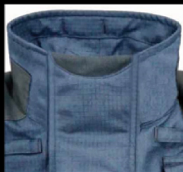
Chin Strap provides comfort under the chin