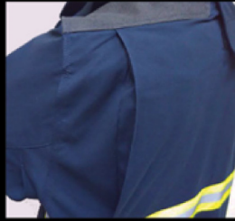
Action Back provides extra ease in movement during different activities